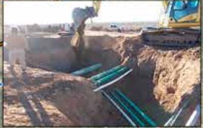
Picture Link Example: Cattle Rustler, LLC Foreign Pipeline Crossing